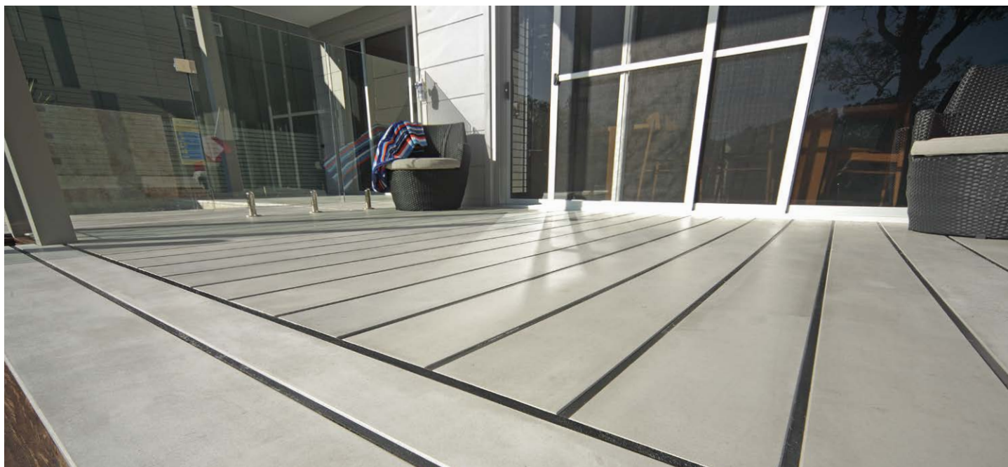
HardieDeck™ boards finished with a clear coat

To minimise wear and tear, and keep your deck looking good for years to come, follow these recommendations: